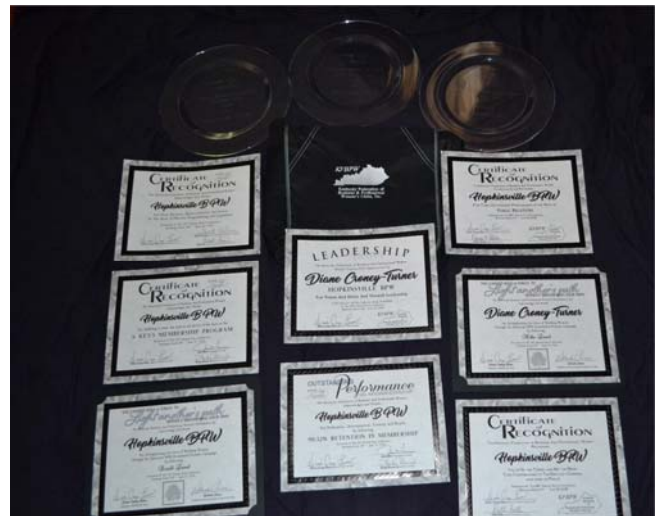
At the Award Luncheon, Hopkinsville BPW received certificates for 90% Retention of Membership, Get Stepping Challenge, Issues Management/ Legislation, KPWW Activities, KY Cardinal Support, KY Foundation, Membership, President's Report and Public Relations and received the following awards for medium size club: Public Relations, Issues Management/Legislation, and Membership.