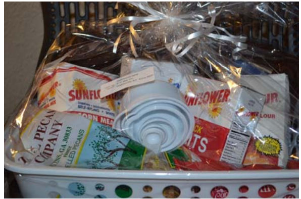
Hopkinsville took two gift baskets to the KBPW Foundation fundraiser

The Foundation raised a total of $2,714.03 with $1,290 from the silent auction and $1,424.03 member donations. The monies raised go to the Promise Campaign to be used for scholarships. The Foundation gave a total of ten scholarships in the amount of $8,500.