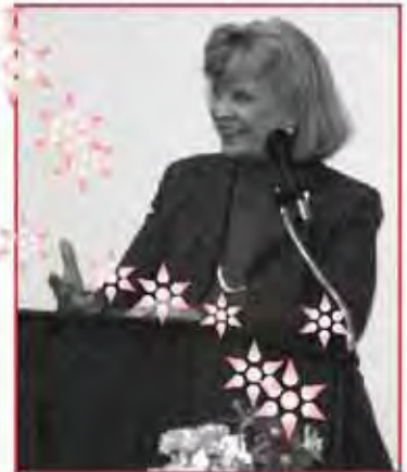
Keynote Speaker Governor Martha Layne Collins