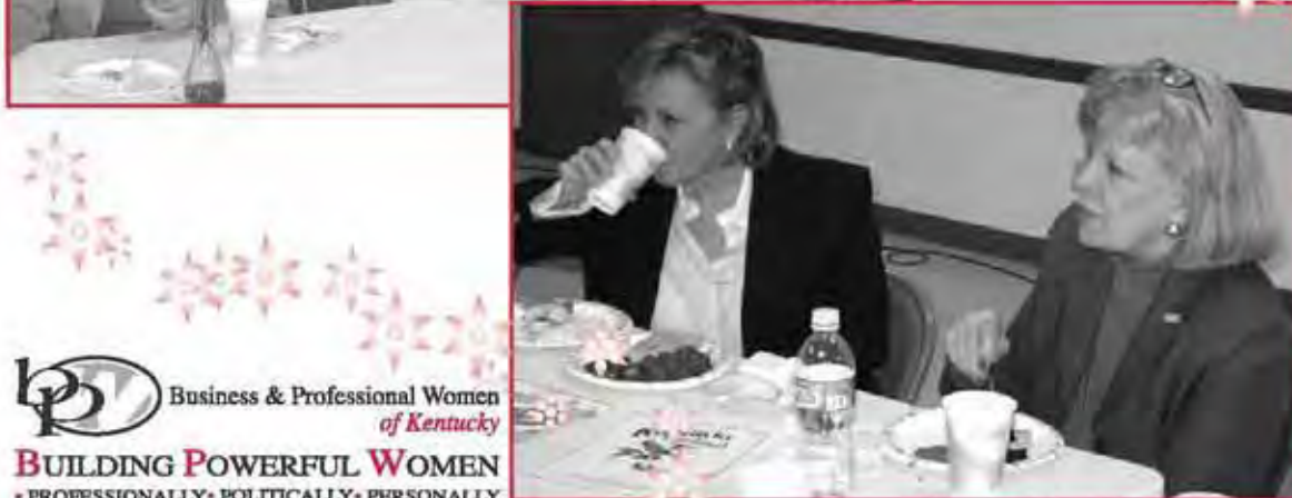
Governor Martha Layne Collins