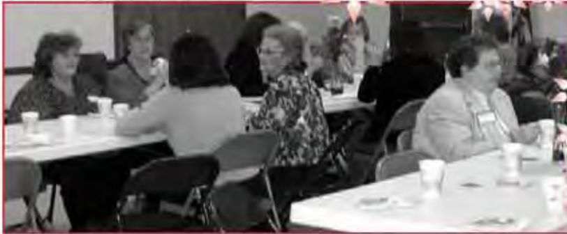
Members & Guests