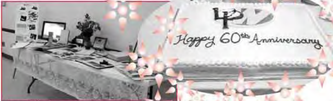
Memorabilia from past years