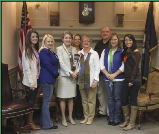
The 2013 Business Equity Award was presented to the law firm of Mattingly, Simms, Robinson and McCain, PLLC

The three awards handed out were 2013 Woman of the Year, 2013 Women of Achievement and 2013 Business Equity Award.