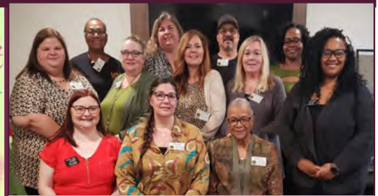
Franklin BPW members who attended the 2022 Interim Board meeting in Bardstovn, KY.