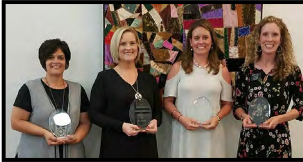
Franklin BPW 2018 Awards Presentation (L-R)