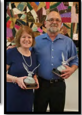
Hall of Fame Inductees